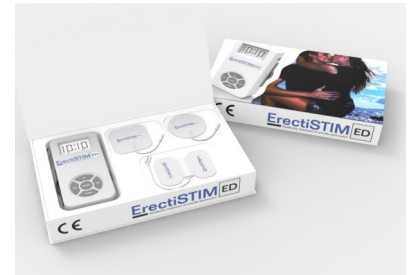
ErectiStim for erectile enhancement and men's sexual wellness erectistim.lionhearthealthstim.com