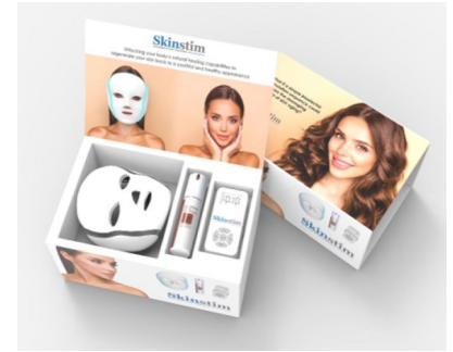
SkinStim for skin rejuvenation - muscle, collagen, tone, and texture improvement. skinstim.lionhearthealthstim.com