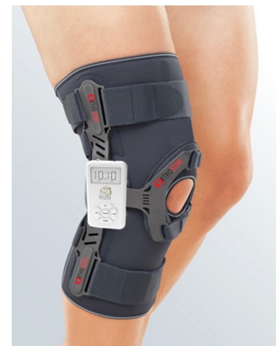
OrthoStim for knee and joint regeneration orthostim.lionhearthealthstim.com