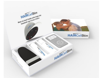
HairCellStim for hair restoration and regeneration of receding hairlines and thinning hair. haircell.lionhearthealthstim.com